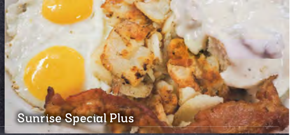
Sunrise Special Plus