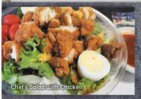
Chef's Salad with Chicken