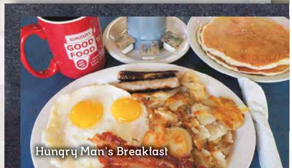
Hungry Man's Breakfast

Two pieces of French toast served with choice of one sausage link or slice of bacon 4.79