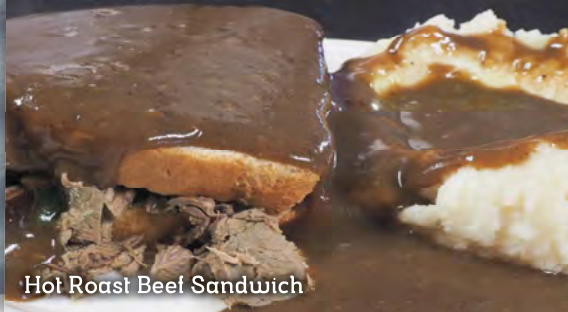
Hot Roast Beef Sandwich