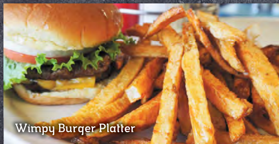
Wimpy Burger Platter

No meat here! Served with lettuce and tomato 5.59