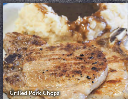
Grilled Pork Chops