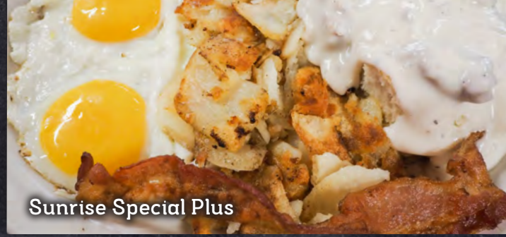
Sunrise Special Plus