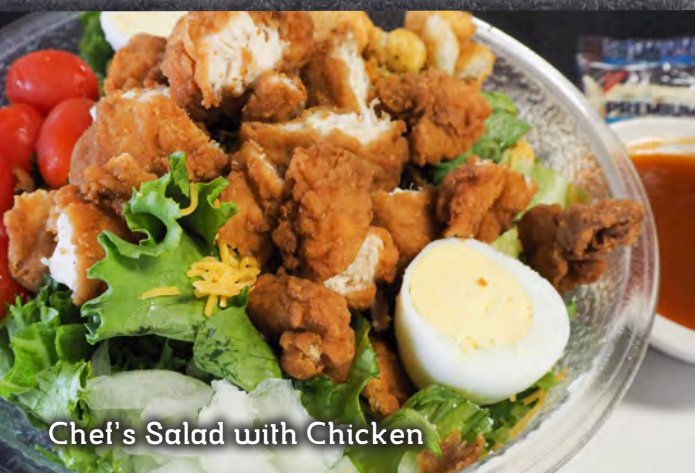
Chef's Salad with Chicken