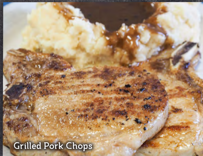
Grilled Pork Chops