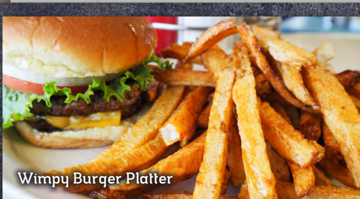
Wimpy Burger Platter

No meat here! Served with lettuce and tomato 7.59