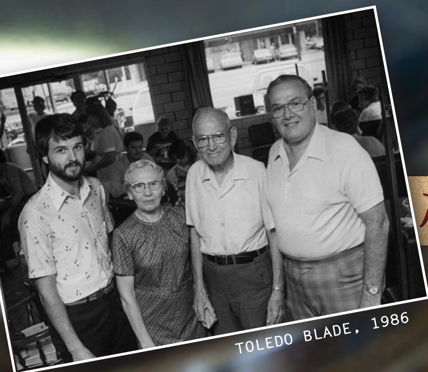
TOLEDO BLADE, 1986