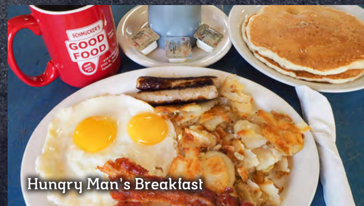
Hungry Man's Breakfast

Two pieces of French toast served with choice of one sausage link or slice of bacon 4.99